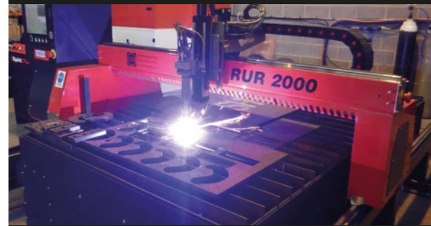
RUR – The best-selling Kerf machine for High-definition plasma applications